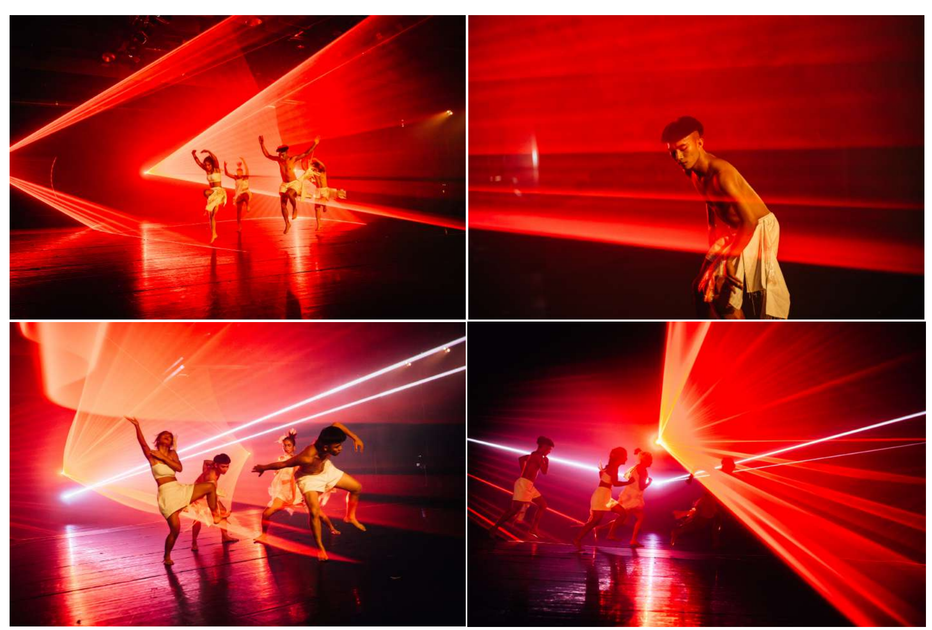
transmitting hunting knowledge - hunting by laser lights