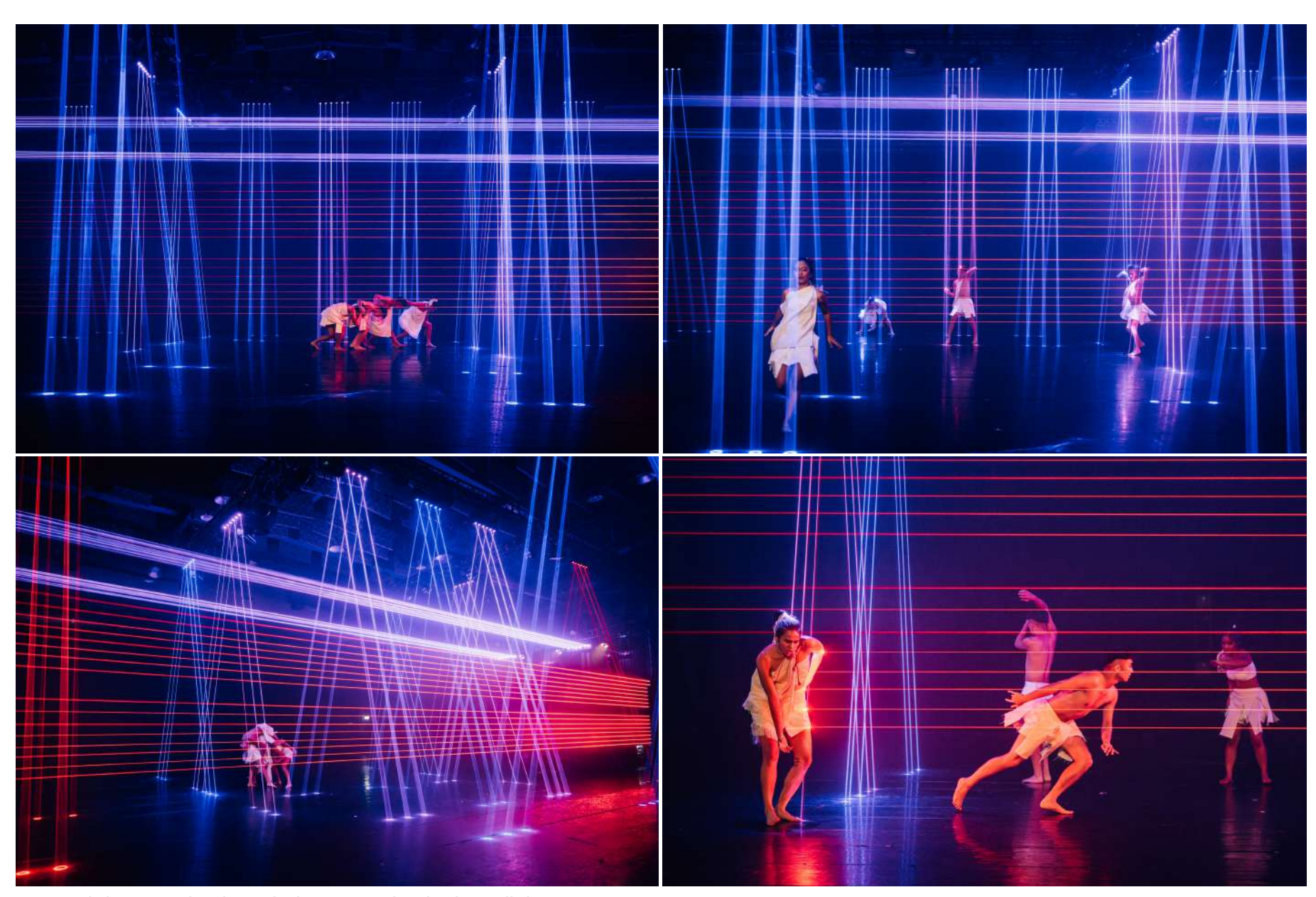
transmitting weaving knowledge - weaving by laser lights