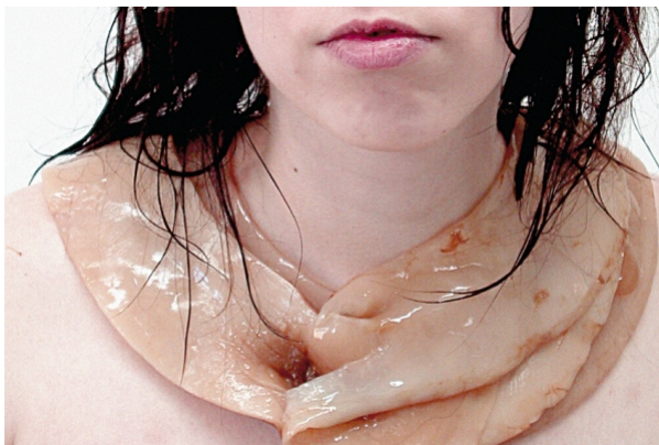
t-shroom (since 2002)

The tea-mushroom, grown in a 3 liter glass jars in homes across Post-Soviet territory, is an agent of open network, trading from home to home, crossing borders from country to country. The T-shroom project is an enterprise, investigating the life and systems of distribution of this social mycelia in a marketing and consumer driven world paradigm. By adopting a t-shroom, one becomes a symbiosis partner joining the network of mushroom-based autonomy. http://open.x-i.net/tsene/indexs.html