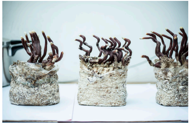
myco-logick at STWST48 (2015) and STWST48x2 (2016)