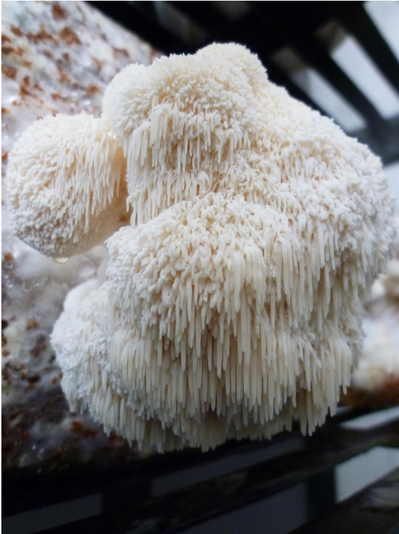
mushroom grown by Taro, 2016