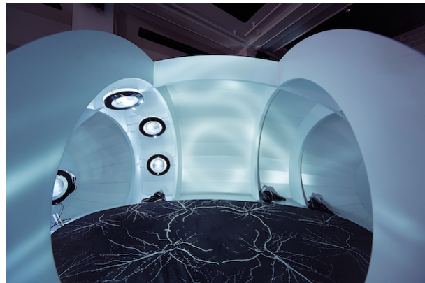
my connect 2016