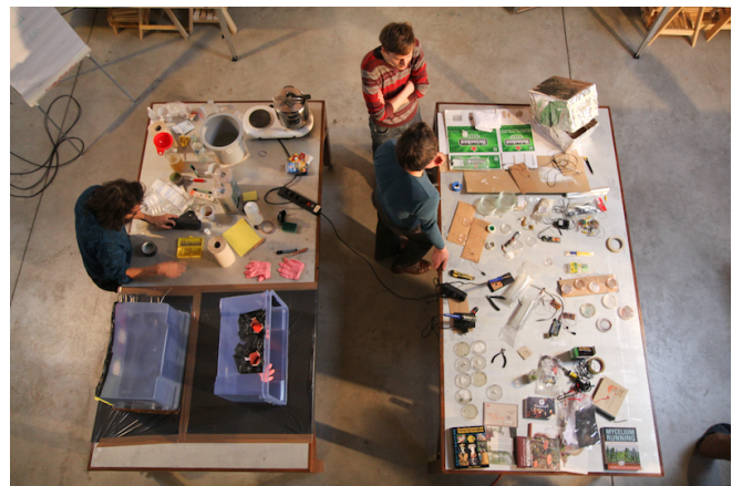
workshop radio mycelium tutorial at [foam], Brussels. (2011)